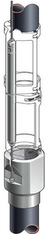
PCP Gauge with clamp-on gauge carrier & ported collar